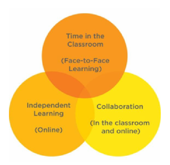
Figure 2.1. Blanded Learing Concept

IJOLTL (2019), 4(3): 173~186. DOI: <a href="https://doi.org/10.30957/ijoltl.v4i3.608">https://doi.org/10.30957/ijoltl.v4i3.608</a>.